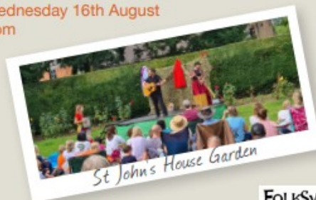
St John's House Garden