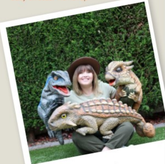
ROAR! Dinosaurs at the Museum!