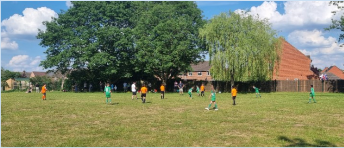
Year 6 Footballers

Nursery are learning about "Jobs and Uniforms" in school at the moment and on Thursday had some visitors in school to help them understand the roles of the police and nurses.