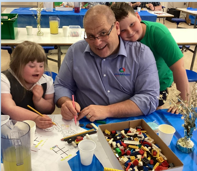
Father's Day Ploughman's and Lego!