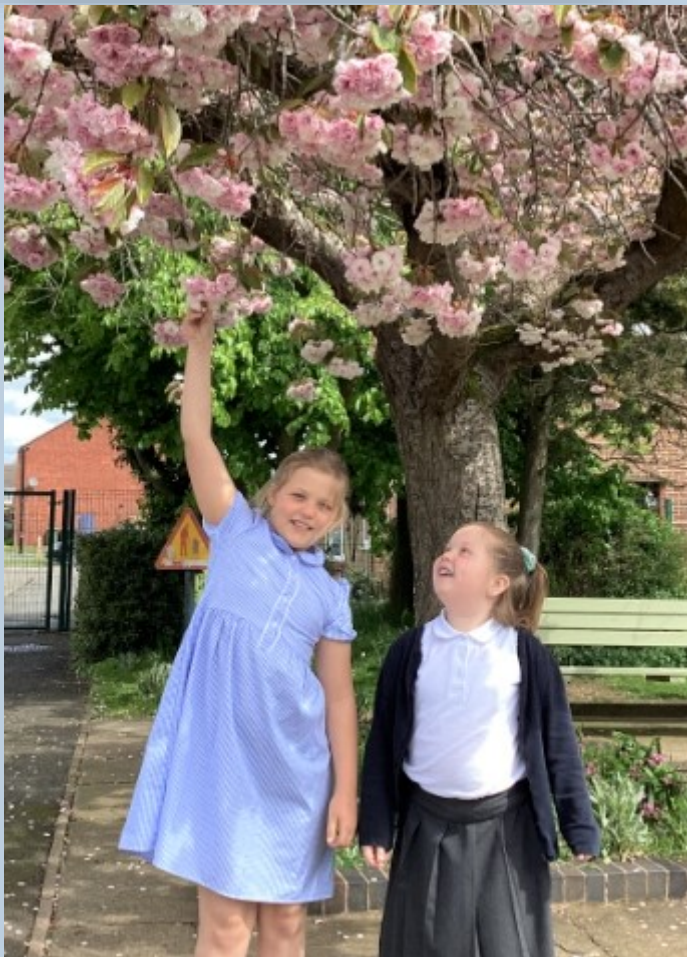
Year 3 photographers Olivia and Lottie took these beautiful photos of spring flowers and our tree in full blossom.