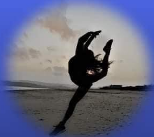
SCSD Dancer

Ballet, Tap & Disco/Street Dance Classes for children & Teenagers (Pre-school Ballet from age 2)