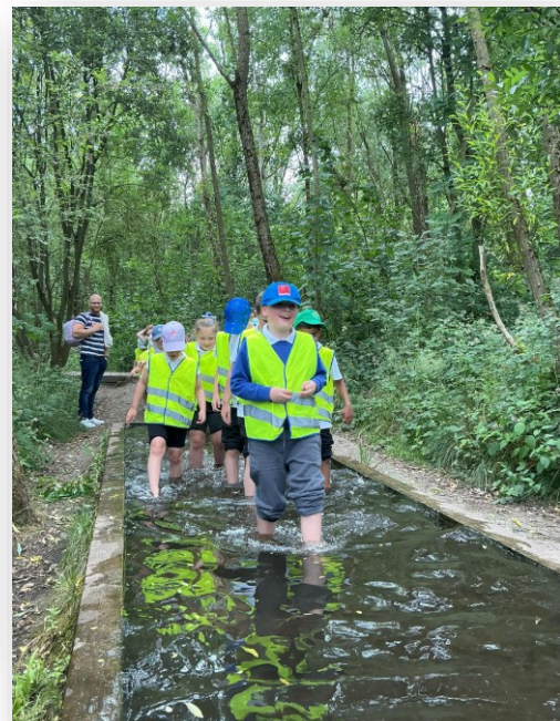
The refreshing barefoot-walk at Conkers last week